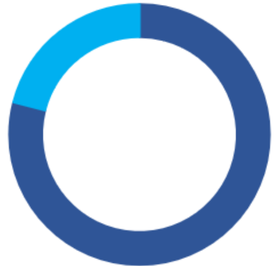
■ C&S App ■ Additional Sources